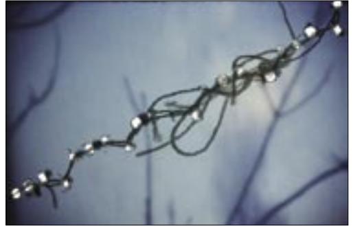
Sabrina Gschwandtner, Phototactic Behavior in Sewn Slides , 2007. Dimensions variable. Cotton thread, 35 mm slides, Kodak Ektapro 9020 slide projector.

The installation consisted of nine machine-knitted photo blankets—which in 2005 became a popular way for families