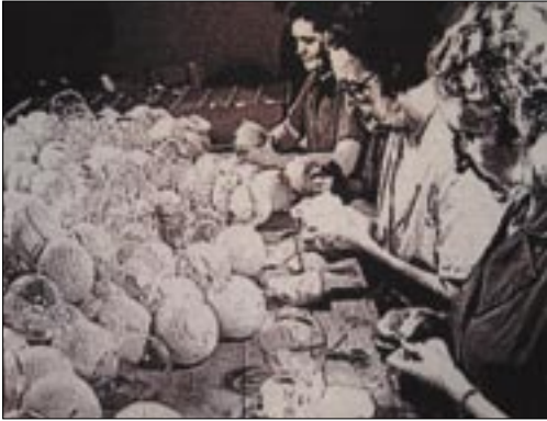
Sabrina Gschwandtner, Wartime Knitting Circle , 2007. Dimensions variable. Machine knit cotton, cotton tablecloth, wooden table and chairs, wool yarn, knitting needles, tape measure, scissors, stitch markers and other knitting notions. Image courtesy of Sabrina Gschwandtner and the Museum of Arts & Design, New York. Photo: Sabrina Gschwandtner: Women war workers make knitted woolen jackets to cover the glass flasks of number 74 grenades (commonly known as “sticky bombs”) at a factory workshop in Britain.

computers translate eight-bit ASCII into letters and words). 7