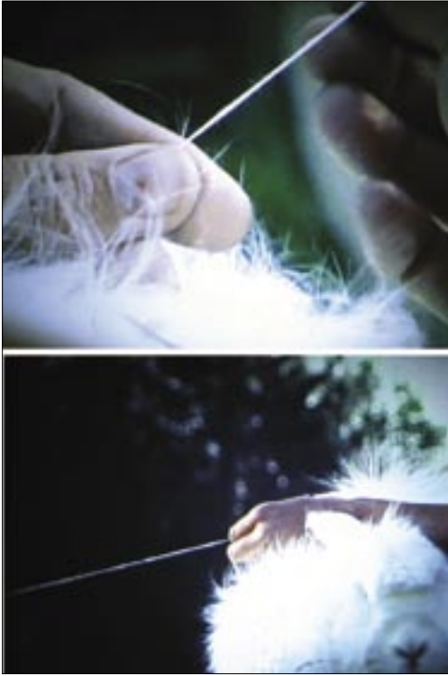
Sabrina Gschwandtner, A History of String , 2007. Dimensions variable. Hand embroidered cotton floss on cotton fabric, one wooden standing embroidery hoop, zoetrope, video (color; sound, RT = loop).

although I had been rigorously devoted to experimental and avant-garde film during all four years of college, handcraft had become my guiding creative format.