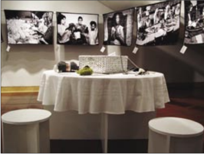
Sabrina Gschwandtner, Wartime Knitting Circle , 2007. Dimensions variable. Machine knit cotton, cotton tablecloth, wooden table and chairs, wool yarn, knitting needles, tape measure, scissors, stitch markers and other knitting notions.

they usually end up commenting on other crafters' blogs or posting to myriad threads on craft community boards. In contrast to the lifestyle associated with the professional craftsperson of the late twentieth century (which is still the academic craft model), DIY crafters fluidly use technology to market and sell their work and participate in their communities. As artist and knitwear designer Liz Collins has remarked, "putting together a MySpace page is not that different from collaging or quilting. You're using different materials, to different ends, but along the way you're starting with matter and transforming it into something else, using your hands and your brain." 11